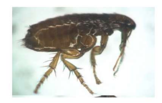
Fig. 1: Ctenocephalides felis samples from Manado North Sulawesi, Indonesia

Study area: Samples of C. felis were obtained from wild cats in several locations in Manado City, namely Karombasan