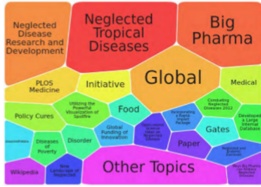
Fig. 6. Clustering Engine about neglected diseases extracted by the authors in Carrot2 (May/2013).

In many developing countries, education and research program are only remake of what the Professors and researcher learnt from exchange or postdoctoral work with western countries. Most of the time, these program if the researcher are good for the core of disciplines such as physics, chemistry, biology, are also in many points of view very far away of the needed of the developing countries, especially researcher did not aim to solve local problem or to valorize natural resourced. In our opinion, it is better to give some advices of what could be done to improve this situation and to provide some simple tools and information able to facilitate the development of an actionable knowledge. Most of the countries speak of innovation as a way to solve the crisis and to improve the local industries. But often there is a misunderstanding about the meaning of innovation.