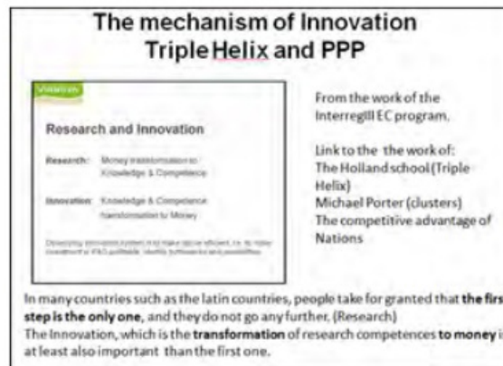
Fig. 3. Research and innovation.

Triple Helix is an ideal way to design and implemented development in developing country. There is an interesting information that again come from Vinnova, a study that sponsored by European community, about the Research and Innovation. In Research, we are going to transform the money the knowledge and Competence that usually sponsored and funded by government, and on other side, Innovation, we are going to transform knowledge and competence to money. The following figure could help us to understand the difference between Innovation and Research.