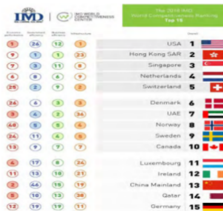
Fig. 4. World competitiveness ranking 2018 by IMD.

There are many success story of every nation in getting success in developing their country. Some to mention USA, England, Finland, Japan, Russia, Korea, Thailand, French, China, Australia and many other nations. The 15 competitiveness country 2018 that released by IMD (International Institute for Management and Development) put Unites States of America at the first place, following by Hong Kong, Singapore, Netherland, Switzerland in big five. The mission of IMD is remain to help countries achieve prosperity and higher quality of life. International Institute for Management and Development is an independent business school, with Swiss roots and global reach, expert in developing leaders and transforming organization to create ongoing impact. The 15 competitiveness country 2018, could being seen at the following figures [11].