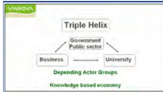
Fig. 2. Triple Helix, cluster development.

an easy job, while government need to control the fair competition, on the other side, government also need to compete with other country in this global competition context. Government has right to control the curriculum of Education/University research and also regulation of company. Industry, but sometimes with its different perspective, it would be really difficult. For example, from Award perspective, government target to be re-elected while industry and business focus on profit, which could be possible for "collaborated" in other way. Government also need to support the company to be innovated in order to make efficient and competitive company of the nation. Figure following is the result of consortium VINNOVA that funded by European community.