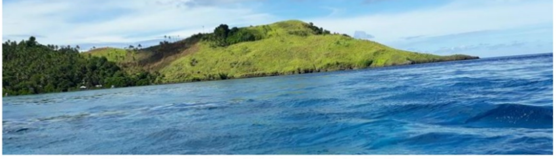
Fig.1: Unproductive land on Kahakitang Island, Sangihe Regency

Life on a small island has more severe challenges than in the large land area. Hurricanes, abrasions, droughts and lack of water are serious problems faced by people on small islands. The use of land with limited size causes pressure to reduce the quality and usefulness of land as shown in Figure-1: