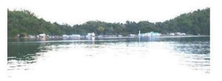
Figure-2. Behongang village, Kahakitang island

village area, located on Kahakitang island. Measurements were made in the residential center of Behongang Village, and the forested beach of Kundaha sub-village. Measurements in coastal waters are the same as in Para and Mahengetang island. The reason for choosing two measurement positions, namely residential and plantation areas is to produce data on the existing condition of the ecosystem as a reference in resource use and environmental management, especially related to the guarantee of water availability. The measurement location, which is a forested beach adjacent to the settlement, is a water source used by the community, especially during the dry season. Measurements in each position are carried out for one day with an hourly measurement interval. Measurements in two positions on land in the same village area are carried out simultaneously. Measurements in two locations on coastal waters within the same village area were carried out simultaneously. Two measurement locations in the Behongang village area are shown in Figure-2 and Figure-3. Kundaha village children become suppliers of fresh water for the community in the parent village of Behongang.