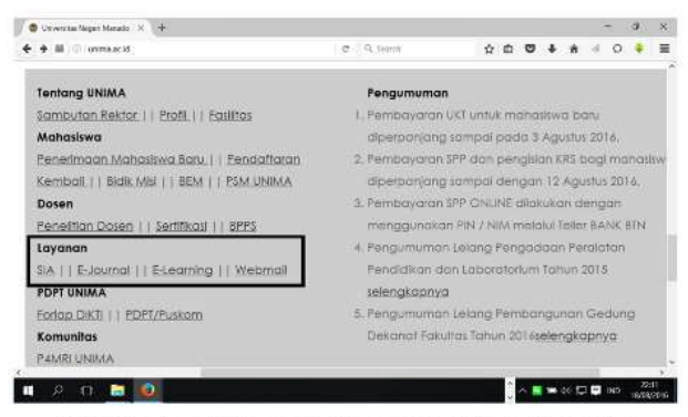
Fig. 2 Services ICT-Based to Support Teaching and Learning Activity at Manado State University

The role of ICT in education today is very important. In this case study at Manado State University has facilities ICT-based to support teaching and learning activity. Can be seen in Figure 2 and 3 are the facilities provided to support the activities of teaching and learning. Where there are facilities Academic Information Systems, E-Journal, E-Learning, and Web Mail is expected to help lecturers and students.