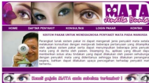
Figure 3. Main Menu Interface (Home Menu)

This research results in a web-based expert system that can recognize the type of eye disease in humans based on the symptoms experienced by patients. This system performs analysis based on the dialogue between the system with the user/patient. The web-based expert system of eye disease diagnosis is designed by using PHP programming language and MySQL for database processing. Figure 3 is the main display image of the eye disease diagnosis expert system.