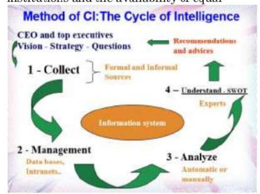
Figure 1 Competitive intelligence method.

The competitive method of intelligence with the support of information technology will produce quality graduates. Therefore, vocational high schools needs to make improvements in terms of professional human resources [11], reliable management, quality teaching and learning activities, access to quality domestic and foreign higher education institutions and the availability of equal