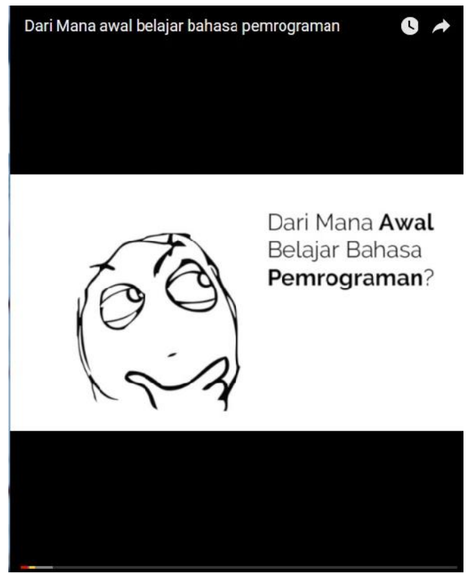
Figure 6. Screenshot Video

IOP Conf. Series: Materials Science and Engineering 384 (2018) 012012 doi:10.1088/1757-899X/384/1/012012