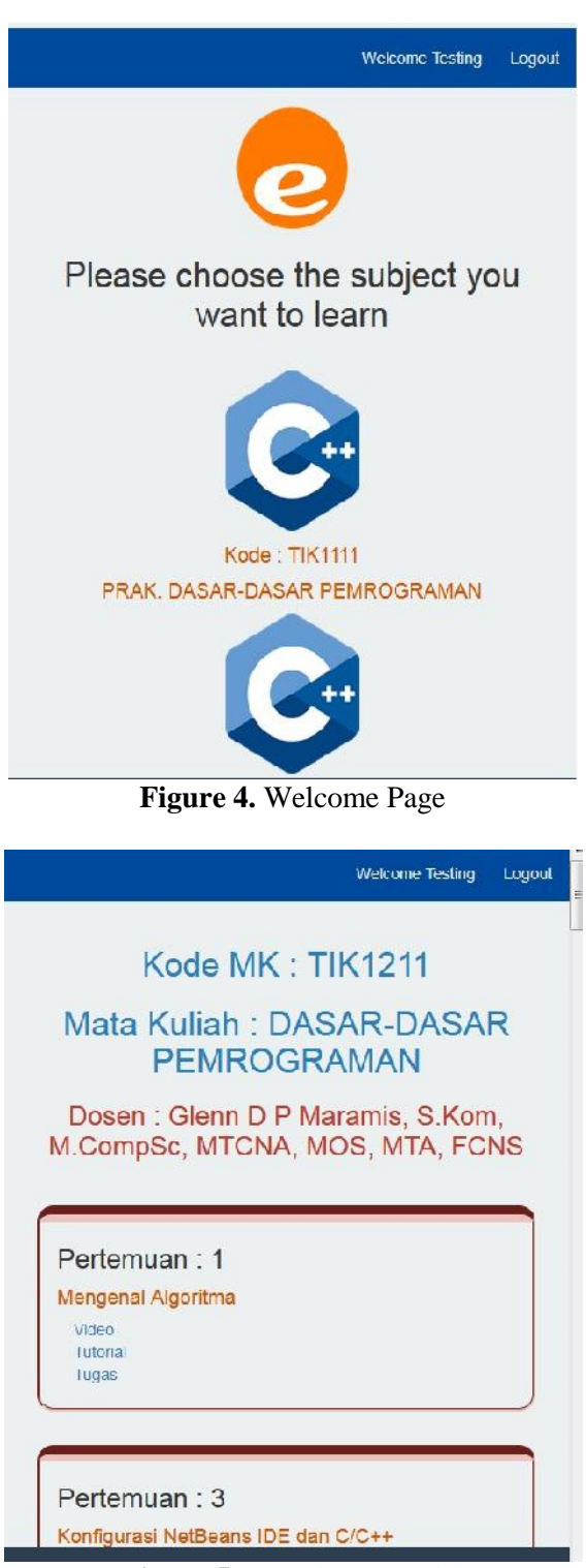
Figure 5. Learning Material

IOP Conf. Series: Materials Science and Engineering 384 (2018) 012012 doi:10.1088/1757-899X/384/1/012012