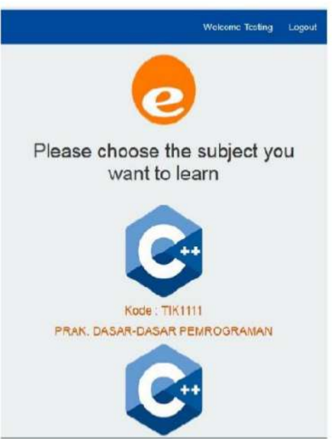
Figure 4. Welcome Page