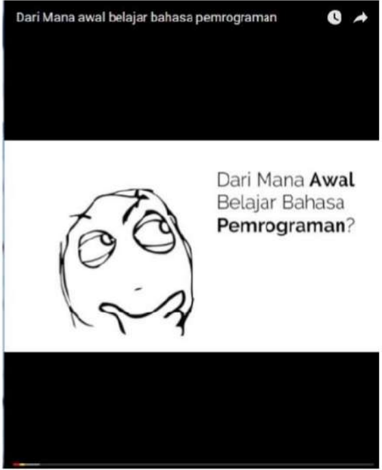
Figure 6. Screenshot Video