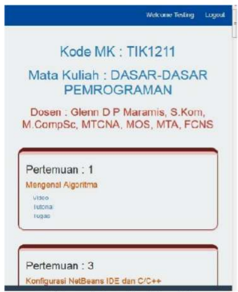
Figure 5. Learning Material

When the user clicked on video link, the video related to the material will shows on the screen. This video is taken and embed in the system. This screenshot video is shown by the figure 5.