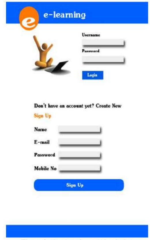
Figure 3. User Interface and Login Screen

As can be seen figure 3 shows the user interface of the e-learning system that will show up for the first time. In this page, user must enter their valid account for accessing the material, otherwise, they must sign up for creating a valid account. The next page will come up is the welcome page. This page show number of programming subjects user may select. Figure 4 shows the welcome page where the student may choose the subject. Every subject contains number of meeting in which every meeting contains different subject that can be taught through video tutorial or written tutorial. This page is shown by the figure 5. As the result, the students can have a better understanding of programming as the material can be accessed many times anywhere and anytime as long as the user has an internet connection to download the materials. The reason why the skill of the student has been increased because the student can watch the video many times until they have a good understanding. When the user seems to struggle with one material, students can ask to the lecturer when they have an off-line class. Therefore, an off-line class also still needed by the students and the lecturer.