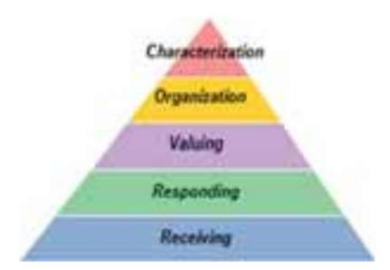
Fig. 1. Five level in the affective domain.

Receiving, students are sensitive and aware of particular phenomenon, individual has willing to tolerate [12].