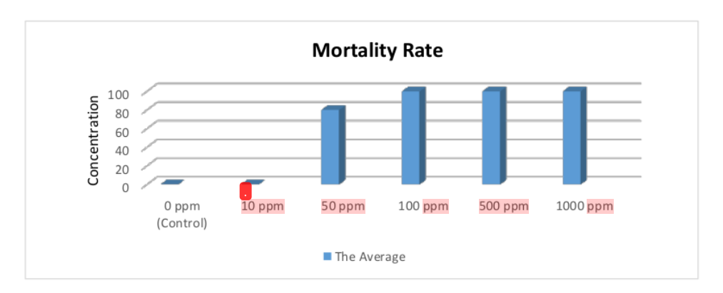
Figure 3.1. Description Average Value and Variation Each Concentration Giving Ethanol Extracts