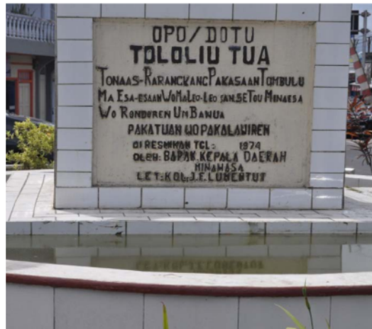
Figure 12: OpoTololiu Monument.

There is still no any attractive public art located throughout the north streetscape. Even though, public art plays an important role in relating the story and identity of the city, creating a landmark and city legibility, and in creating opportunity for residents and visitors to participate and share in its development (Jordan, 2016; Rehan, 2013).