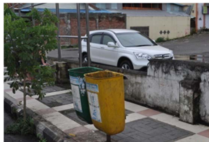
Figure 11: Broken Trash Bin.

OpoTololiu Monument Garden is located in a busy lane of mobility of motor vehicles but at the same time easily attract people because it is at the crossroads. The fountain conditions that have been damaged cause water puddle problems (Figure 12). Plants that are currently growing seem not yet well designed and managed. The overall appearance of the monument OpoTololiu Monument Garden needs to be redesigned so that this streetscape element becomes one of the accessories that support the appearance of the city.