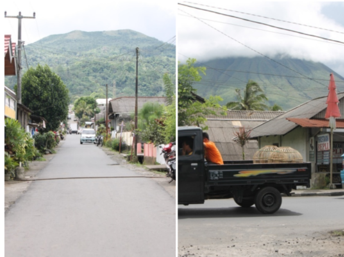
Figure 2: Beautiful Natural Views from Mainstreet (Mount Masarang and Mount Lokon)