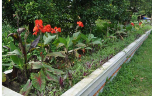
Figure 5: Green Line of Streetscape around the North Gate.

In addition to the improvement of the physical structure, the rearrangement of the northern gateway needs to be done. First, the use of ornamental plants with the dominance of green at this time needs to be replaced with ornamental plants are more colorful than the color of flowers and leaves. This is because the background of the park itself has been dominated by the green color with the trees. The use of flowering ornamental plants is needed because it is related to the effort to show the characteristic of Tomohon City as the City of Flowers. In addition, it is necessary to increase the length of the park with a theme to reinforce the impression moreover this park enjoyed from vehicles that are going through it.