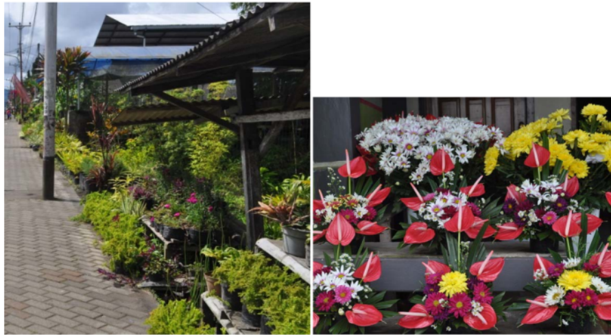
Figure 3: Some Stalls of Landscape Plants and Cut Flowers Stores that Characterize the Streetscape of Tomohon City

In the city of Tomohon found several stalls where to sell plants for the manufacture of landscape plants as well as kiosks of cut flowers either that have not or have been strung. The existence of these stalls became one of the characteristics of Tomohon City and is a potential that needs to be managed.