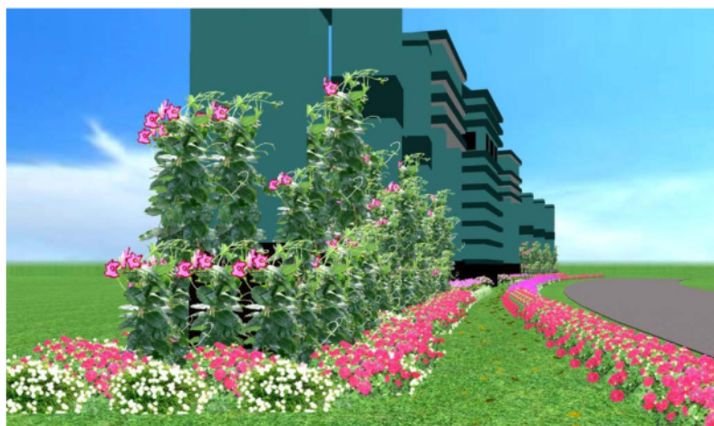
Figure 14: Streetscape around Rest Area