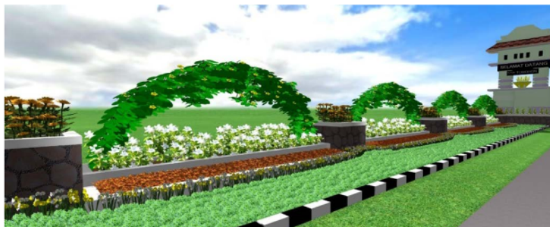
Figure 13: North City Gate Park

The concept of streetscape design enhancement above is translated into some streetscape elements (Figure 13).