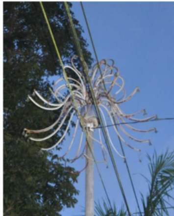
Figure 10: Dangerous Street Lights.