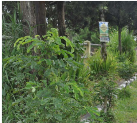
Figure 6: Some points of the Sidewalks are Disrupted Because of Electricity Poles, Broken, Dark at Night, or Already Covered by Trees and Weeds.