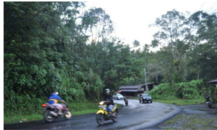
Figure 1: General Condition of Streetscape Between the North Gate and the Settlement Area.

After passing the north gateway of the Tomohoncity, there is a still a very long pause before reaching the residential area in general or downtown area (Figure 1). Based on observations, scenic vistas -whether to expansive open space areas within the city or to the mountains beyond- are a key element of the nature of Tomohon City's streetscape (Figure 2). The city's varied topography provides beautiful panoramic views to Manado City, Mount Tumpa, Manado Tua Island, sea, agroforestry landscape, Mount Lokon, Mount Masarang, and Mount Tampusu.