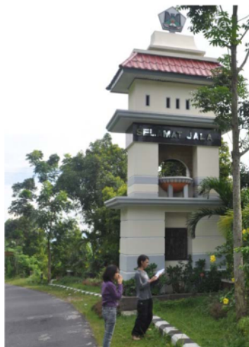
Figure 4: North Gate of Tomohon City

Indeed, with the city development plan as tourist destination city, Tomohon City should have a reception area which is capable of performing functions as a greeter area of its visitors as well as the function of the information giver and the identity of the city.