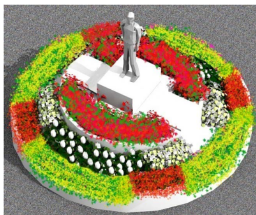
Figure 15: OpoTololiu Monument