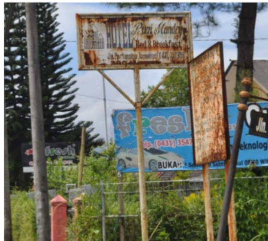
Figure 9: Condition of Some Information Boards Requiring Repairs or even Replacement

We found many rusty signage and old decorative lights that are no longer working or broken some parts (Figure 9). Not only with the reasons for revamping the face of the city, but also the security, the immediate handling is really needed. Some of the dustbins along the main road were broken so that cause problems with both visualization and bad smell (Figure 10). There are points where the sidewalks cannot be used anymore because of hole or unmanaged plants (Figure 11).