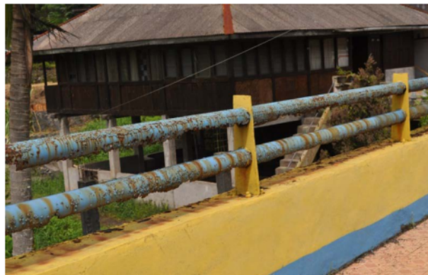
Figure 7: The bridge grip is rusty.

In the green that are found along the North-South main street, the existing vegetation were recorded. The high vegetation constitutes only of trees of Samaneasaman . In the central area of the city, there are rows of Samaneasaman trees planted tightly between the asphalt road and the sidewalk. In some area, these trees are planted on the asphalt road after making small holes at street (Figure 8). The presence of various types of trees on the edge of the road, pedestrian and in the city parks create the comfort, beauty, and serve ecological functions (Brown, Vanos, Kenny, & Lenzholzer, 2015; de Groot, Alkemade, Braat, Hein, & Willemen, 2010; Díaz et al., 2007; Fadli Rahman, Josephus I. Kalangi, 2018; Saroinsong, F., J I. Kalangi, 2017; Yusviana Botha, Fabiola B. Saroinsong, 2017). Trees in streetscape can reduce air temperature by blocking sunlight, reduce wind speed, absorb and block noise and reduce glare, absorb carbon dioxide and potentially harmful gasses, such as sulfur dioxide, carbon monoxide, from the air and release oxygen, help settle out and trap dust, pollen and smoke from the air, and can create an ecosystem to provide habitat and food for birds and other animals. The planting of this tree species, Samaneasaman , receives the attention of researchers, because naturally this tree can grow large with roots that can damage asphalt roads, sidewalks, and waterways under the sidewalk. For the best use of plants, there are several