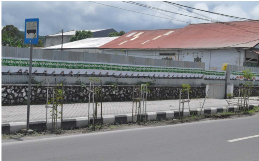
Figure 8: Planting of Trees in Centre of Tomohon City

things to consider in the selection of plants. They are, compatibility with the local climate, presence or absence of obstacles to a particular view, root and canopy growth, environmental stress resistance, maintenance needs.