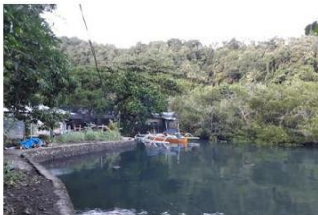
Figure-3. Kundaha, sub village of Behongang