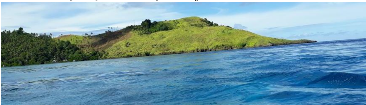
Fig.1: Unproductive land on Kahakitang Island, Sangihe Regency

Life on a small island has more severe challenges than in the large land area. Hurricanes, abrasions, droughts and lack of water are serious problems faced by people on small islands. The use of land with limited size causes pressure to reduce the quality and usefulness of land as shown in Figure-1: