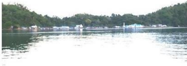
Figure-2. Behongang village, Kahakitang island

village area, located on Kahakitang island. Measurements were made in the residential center of Behongang Village, and the forested beach of Kundaha sub-village. Measurements in coastal waters are the same as in Para and Mahengetang island. The reason for choosing two measurement positions, namely residential and plantation areas is to produce data on the existing condition of the ecosystem as a reference in resource use and environmental management, especially related to the guarantee of water availability. The measurement location, which is a forested beach adjacent to the settlement, is a water source used by the community, especially during the dry season. Measurements in each position are carried out for one day with an hourly measurement interval. Measurements in two positions on land in the same village area are carried out simultaneously. Measurements in two locations on coastal waters within the same village area were carried out simultaneously. Two measurement locations in the Behongang village area are shown in Figure-2 and Figure-3. Kundaha village children become suppliers of fresh water for the community in the parent village of Behongang.