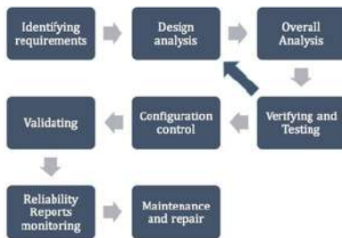
Fig. 5. Research Method

All these above-mentioned activities must be done in a sequence or at a right time to achieve a reliable and durable product. Following is the flow infrastructure of these above activities and if done in this way can help Higher Education to get a reliable cloud servers.