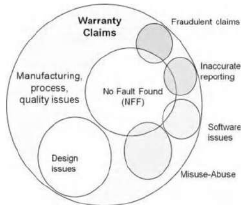
Fig. 2 Warranty Database Content [17]

Warranty data must be routinely used for reliability and warranty prediction in new product development. Field failure data of existing products can be used as a reliability predictors of future products than some of the traditional methods, such as reliability growth models or standards-based predictions. Working with warranty data requires an understanding of its specifics and limitations in order to produce meaningful results [17].