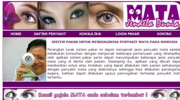
Figure 3. Main Menu Interface (Home Menu)

This research results in a web-based expert system that can recognize the type of eye disease in humans based on the symptoms experienced by patients. This system performs analysis based on the dialogue between the system with the user/patient. The web-based expert system of eye disease diagnosis is designed by using PHP programming language and MySQL for database processing. Figure 3 is the main display image of the eye disease diagnosis expert system.