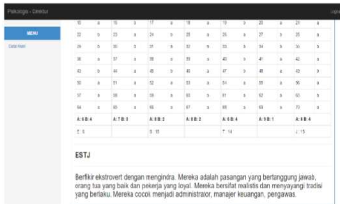
Figure 2. Form of recommendation results.

The highest accuracy of the results of the process of determining professional recommendations in accordance with the personalities of each individual is determined by using Bayesian method determined the largest percentage of the existing values and obtained results at intervals 20 and 70. Where at interval 20, obtained Dimension concentration of 66 %, Dimension to understand information from outside by 67%, Dimension drawing conclusion & decision equal to 71%, Dimension of lifestyle get equal to 73%. While at Interval 70, Dimension concentration of 68%, Dimension of understanding information from outside by 72%, Dimensions drawing conclusions & decisions by 75%, Dimensions of lifestyle earn by 71%. Thus the system period will display the results of the recommendations shown on the professional recommendation form.