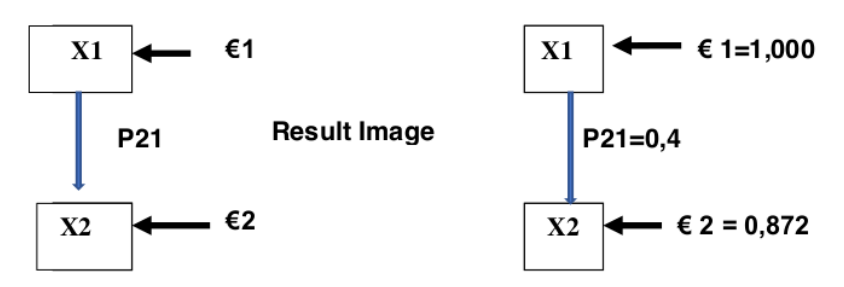
Figure 4.5 Relationship of the Structure Path Diagram 1

Based on the results of path analysis calculations in structure 1, path coefficient values are obtained which indicate a causal relationship in the analyzed structural model as presented in the following figure: