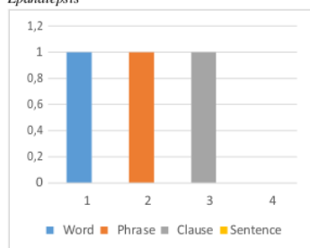
Figure 3 Epanalepsis

The diagram indicates that the epanalepsis expressions that appear in the form of repetition are not many. It seems that the structure of the use of the word at the beginning of the sentence must be exactly the same at the end of the sentence is difficult to apply. This is inconsistent with the proposition indicated by the findings of research (Munthe & Lestari, 2016) on the repetition in "Wendys' Tagline revealing that epanalepsis is one of the dominant repetitions used, which potentially "shows emotional spontaneity" and "raises "it (p. 170). This suggests that in terms of rhetoric texts or especially in the form of speech, epanalepsis is not regarded to be as effective as in the advertising form. It seems to be the ground for not being frequently included in the lines of Trump's addresses.