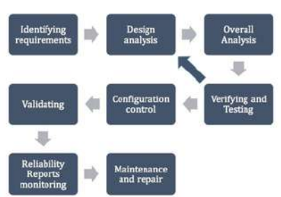
Fig. 5.Research Method

All these above-mentioned activities must be done in a sequence or at a right time to achieve a reliable and durable product. Following is the flow infrastructure of these above activities and if done in this way can help Higher Education to get a reliable cloud servers.