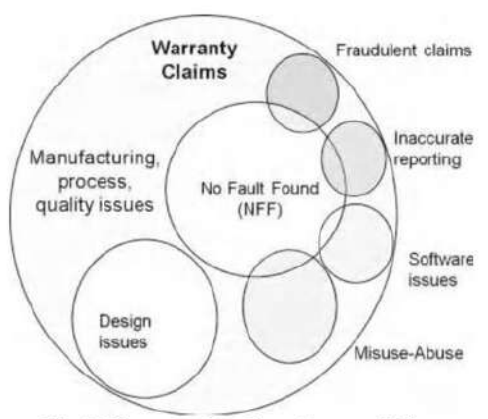
Fig. 2-Warranty Database Content [17]

4 Warranty data must be routinely used for reliability and 4 pranty prediction in new product development. Field 4 llure data of existing products can be used as a reliability 4 edictors of future products than some of the traditional methods, such 2 reliability growth models or standards-based 2 edictions. Working with warranty data requires an understanding of its specifics and limitations in order to produce meaningful results [17].