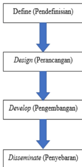
Figure 1. 4D Development Research Model

This research uses development research with 4D model which was developed by Thiagarajan, et al in 1974. 4D stands for Define, Design, Development and Dissemination. However, in this research, it only reached the 3D stage.